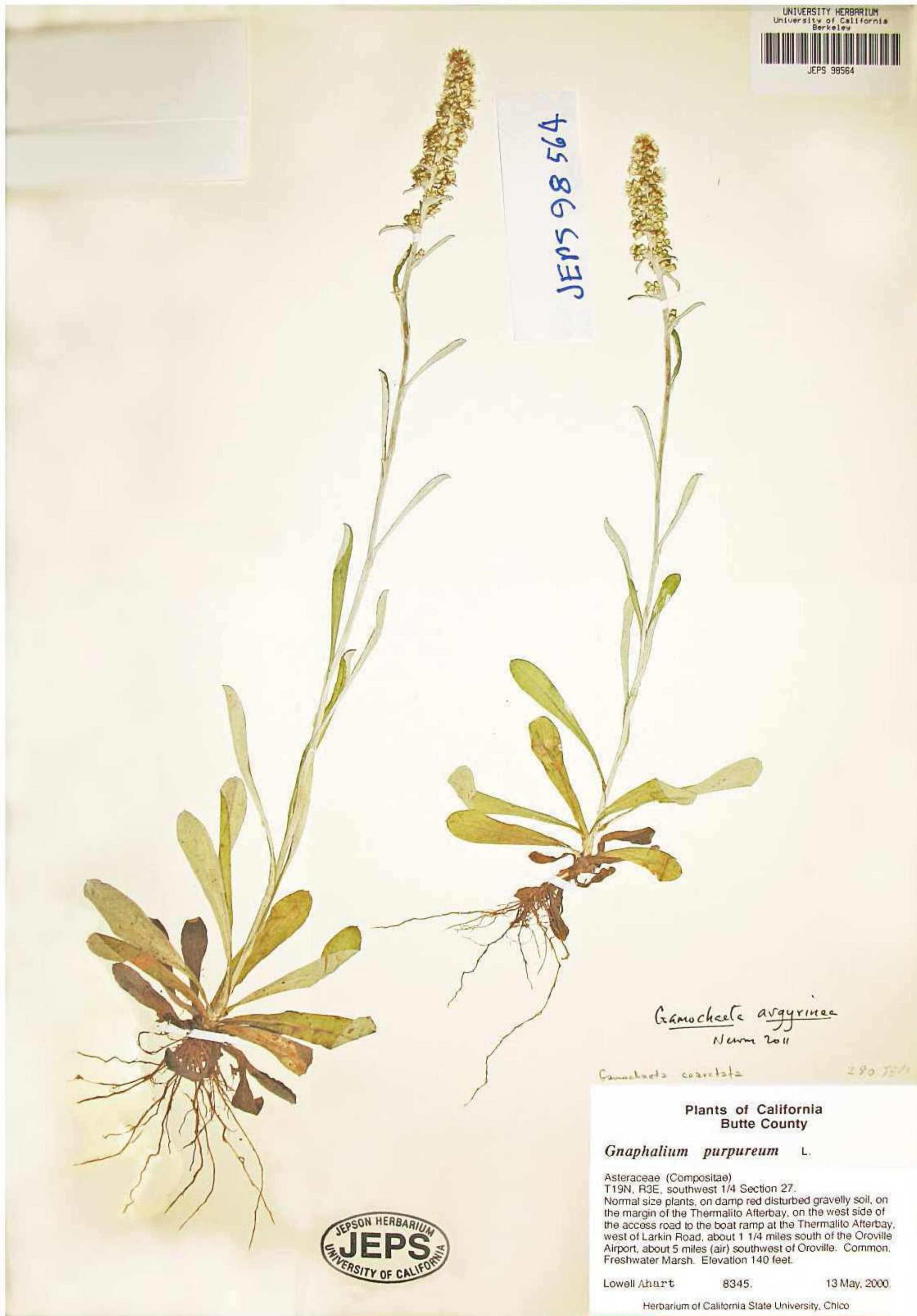
Figure 2. Gamochaeta argyrinea from Butte County (JEPS), margin of the Thermalito Afterbay, 13 May 2000.